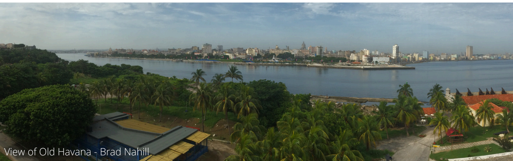
View of Old Havana - Brad Nahill

You'll learn about the impressive effort that goes into protecting and studying these turtles and the success they have had in growing the number of nesting green and loggerhead turtles. That night, you'll drive to the nesting beach to look for nesting green sea turtles and hatchlings (about a 30 minute drive each way). Overnight at Cabinas La Bajada. (3 nights). (B, L, D)